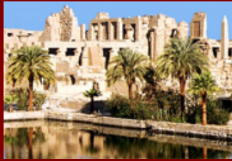
Kernak Temple, Luxor