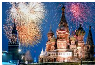
St. Basil's Cathedral

Your morning half-day panoramic tour by private car and guide gives you an overview of the most important sites in the city including: the University of Moscow, the Bolshoi Theater, the Olympic Stadium, and the G.U.M. Department Store, one of the largest in the world. Continue to impressive Red Square and St. Basil's Cathedral, with its vividly painted onion domes. Evening at leisure. (B)