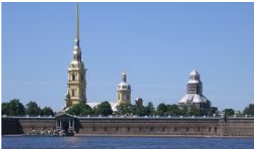
Peter and Paul Fortress

In the morning, meet your local guide and driver. Your half-day panoramic city tour includes a drive past some of the city's most famous sites: St. Isaac's Cathedral, one of the largest domed buildings in the world; the bronze statue of Peter the Great, founder of the city; the Admiralty building; and the extraordinary Winter Palace. Afternoon at leisure. (B)