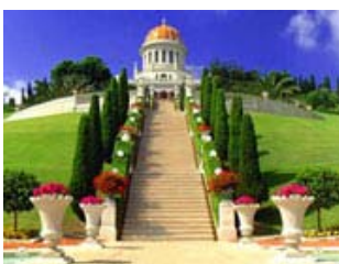
Bahai Hanging Gardens