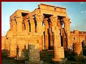
Temple in Komombo