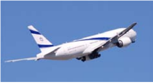
El Al Airplane