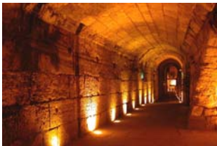
Western Wall Tunnel