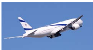
El Al Airplane