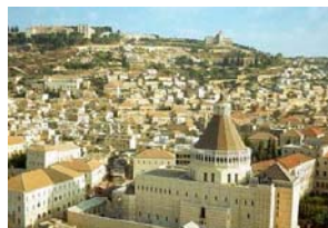
Nazareth / Beit She'an