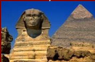
The Sphinx and Pyramids